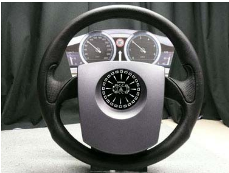
Study of a steering-wheel with an integrated circular OLED signage device.

The CARO partner Optrex Europe GmbH was responsible for the layout of the display, the manufacturing and the subsequent contour cut of the textured OLED substrate, as well as for the interconnection of the display including the implementation of different animations (each of the shown segments could be separately addressed). The processing of the OLED device itself was performed at the Fraunhofer IPMS in one of the existing OLED manufacturing lines. The styling-studio G.Pollmann GmbH created the concept of the study, built up the demonstrator and carried out the integration of the OLED display.